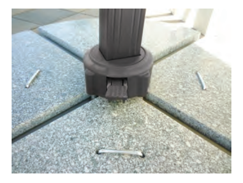
Foot Activated Lever to Rotate Pole 360^{\circ}