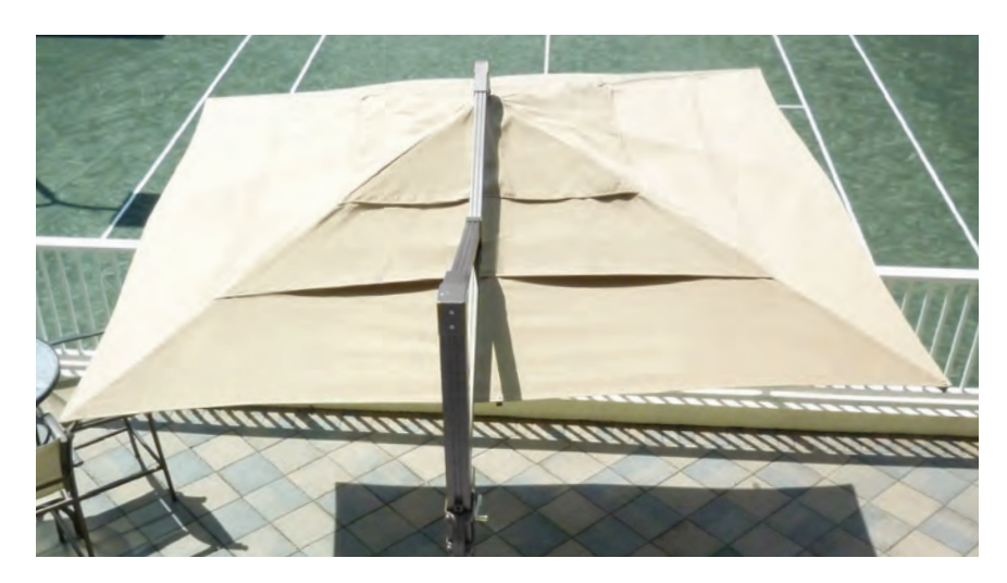
Detail of Canopy